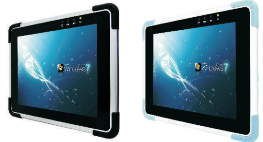
Black / Silver