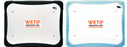
Blue / White