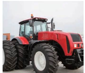
Automatic Driving Agricultural Machinery